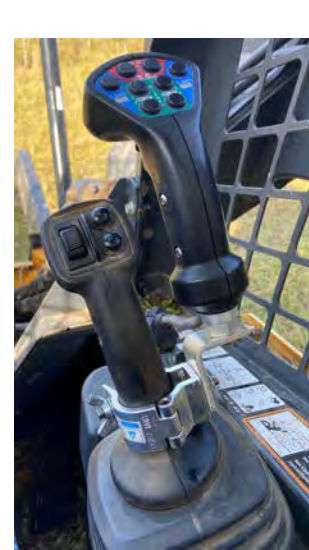
Standard Wireless Remote